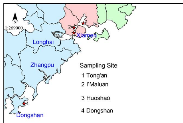
Fig. 1. Sample sites.

The sampling sites are shown in Fig. 1. The site of Huoshao is located in the Xiamen western sea area and very near to Dongdu harbor, the main port area in Xiamen, which is considered the most polluted site. I'Maluán site has limited tidal exchange with the adjoining Xiamen western sea via a small channel. It was mostly occupied by a high density of cages for shellfish and fish culture during sampling time. The Tongan site is zoned for aquaculture use, but in recent years industrialization and urbanization have developed rapidly, resulting in increased waste and sewage discharges to the sea. Dongshan Island, located 200 km to the south